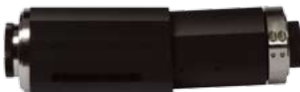
ImSpector V8E/V10E spectrograph, side view