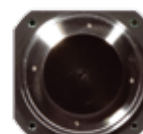
ImSpector V8E/V10E spectrograph, front view