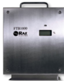
RAE PowerPak External Battery