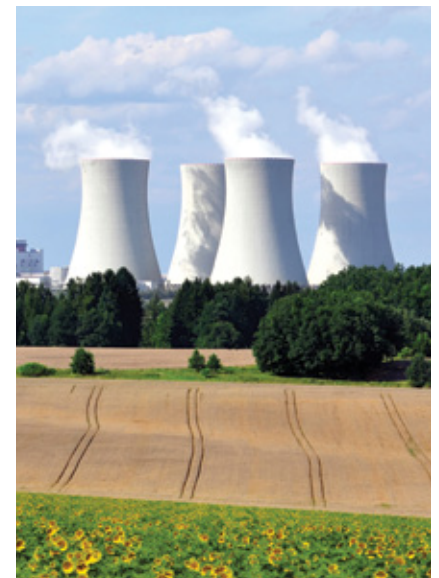
Meshguard Gamma provides real-time, 24 x 7 radiation detection for fence-line and area monitoring applications.