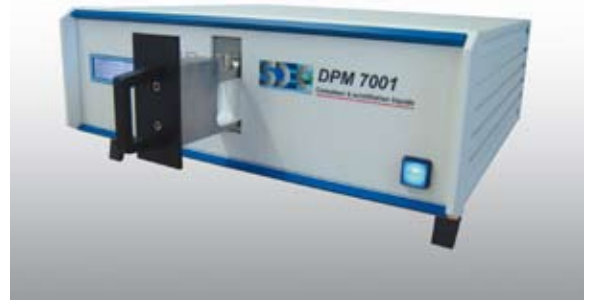
DPM7001, with flask holder open