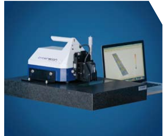
Depth of laser scribing