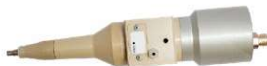
094-RDE without tip