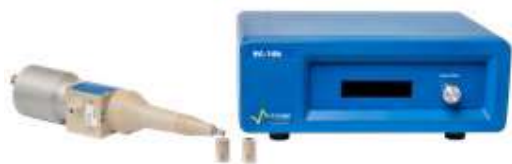
094-RRDE with tips and 094-RC