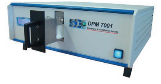
DPM7001, with flask holder open